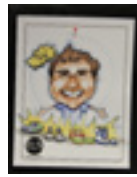
Photo Dry Erase Boards